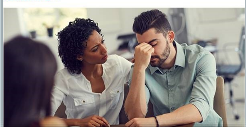
Suicide can be hard to discuss

Your EAP can help you start a conversation