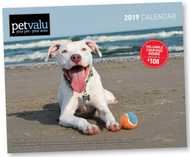
Local calendar proceeds will benefit